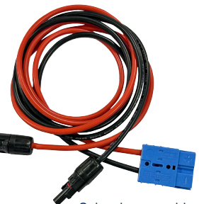
Solar charger cable (SB50 to MC4 connectors)