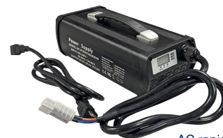
AC rapid charger