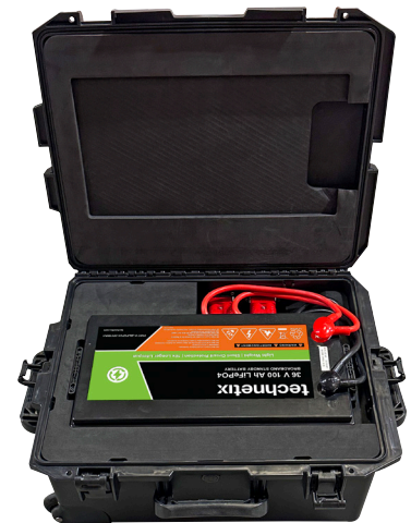
LBBG-3600 (open view)