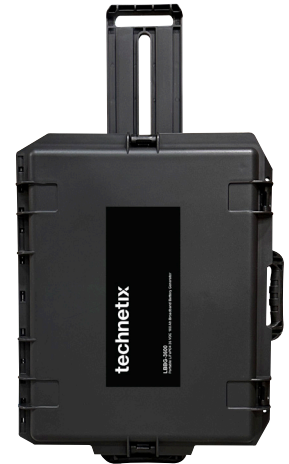
LBBG-3600 (front view)