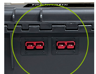
LBBG-3600 (side close-up view)